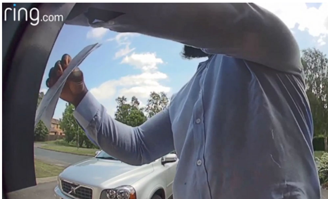
Image Above: A criminal caught in the act by a Bearsted resident's video doorbell.

If you have an external letterbox - beware!